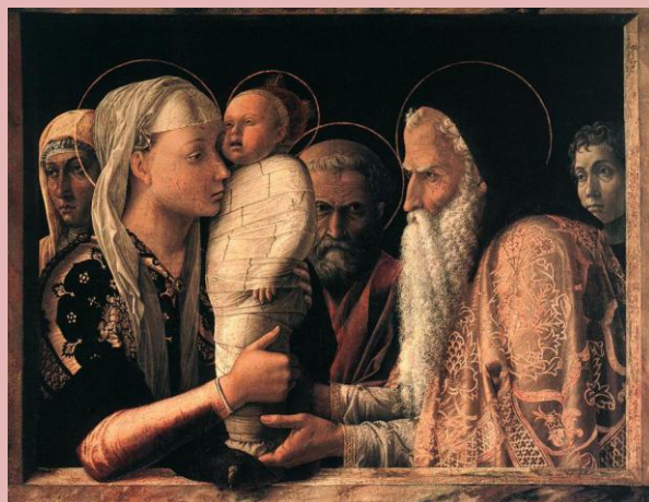
Andrea Mantegna 1431-1506