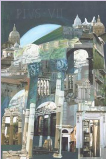
Anne Bate Williams

Abstract and floral paintings in oil and acrylic. Figurative sculptures in cement and bronze resin. Paintings and mixed media collages