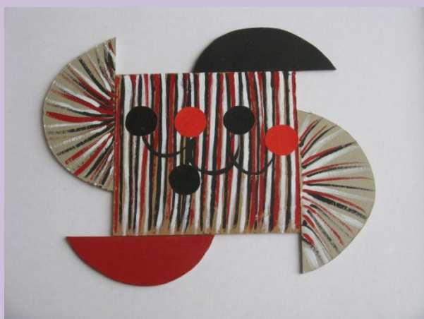
Sir Terry Frost